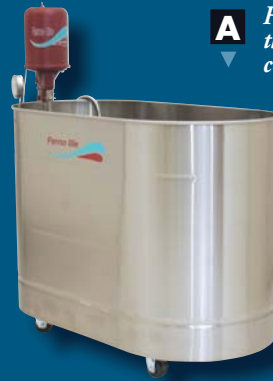
A Features a second motor that powers the drain pump, completely emptying the tank.