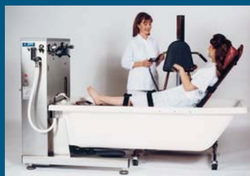
Designed to be used with Hubbard tanks, burn tanks, and a wide variety of supine fixed and height-adjustable bathing and hydrotherapy units.