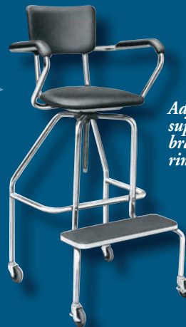
Adjustable flat seat is supported between “ladder” brackets hanging from tank rim.