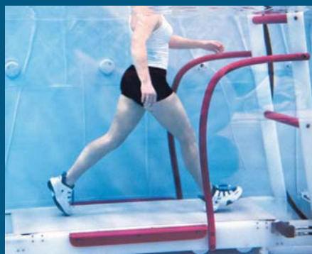
Hydrostatic pressure. Higher intensity at a lower heart rate.